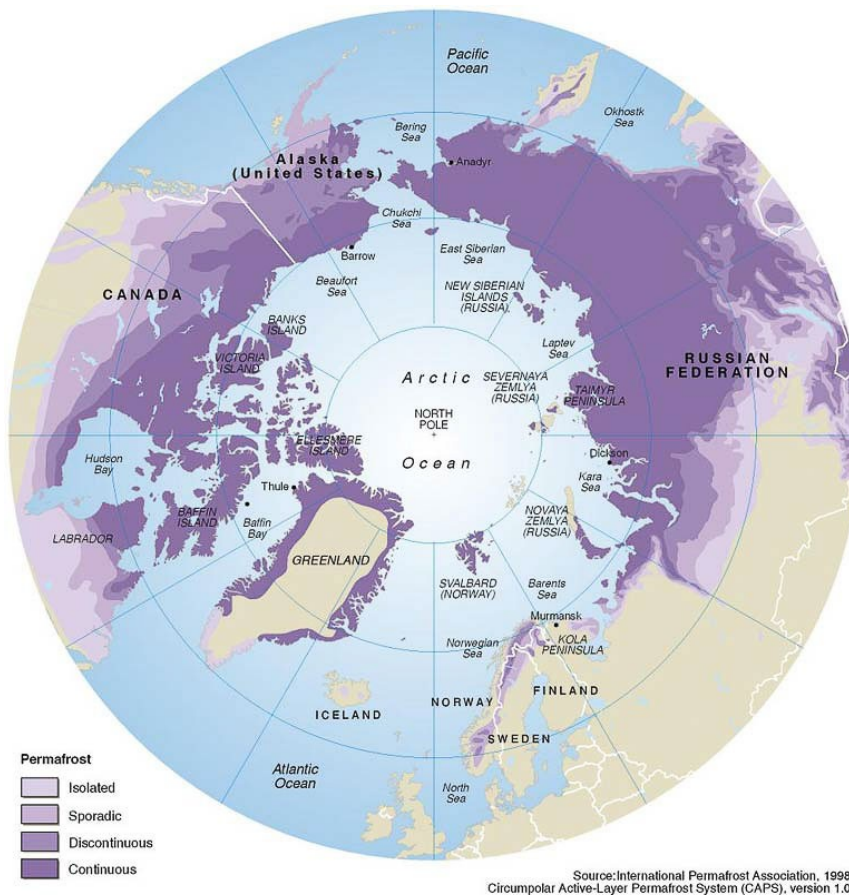
Figure 1. Permafrost distribution in Nordic territories.

In addition, another of the features of the climate of Yakutsk is the presence of permafrost soils.