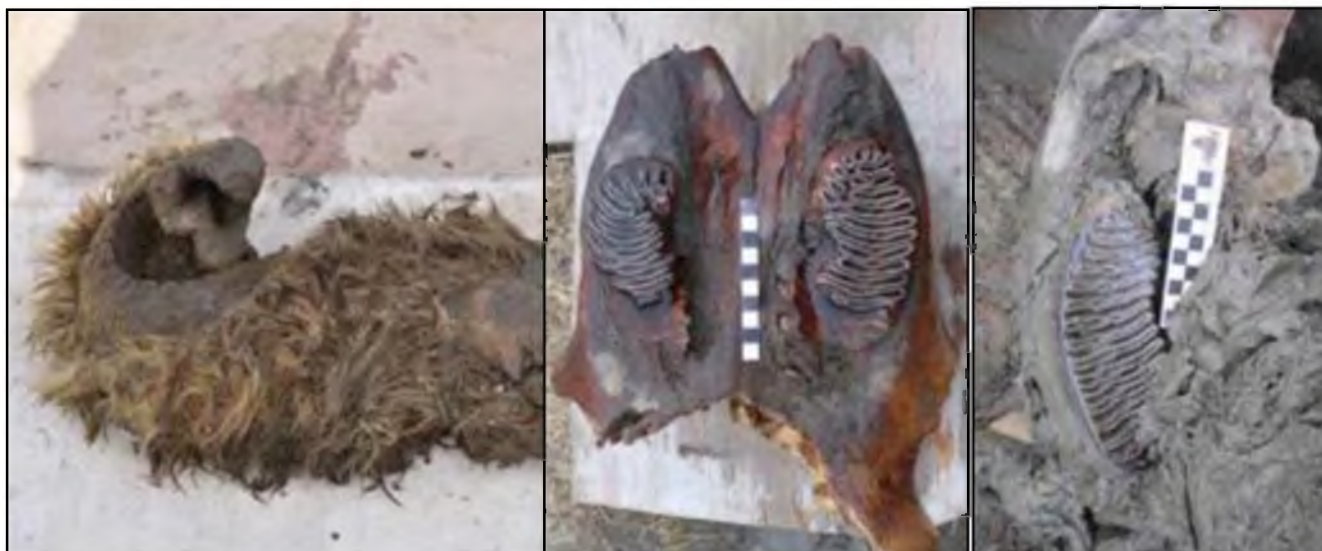
Fig. 2. A, trunk; B, maxilla; C, left m3 of the woolly mammoth carcass from Malyi Lyakhovskii Island (New Siberian Islands).

age of about 47 yr. If the uppers are M3s, it is unusual for them to be more advanced in wear than the lowers (normally, lowers are more advanced). The uppers may therefore be M2s that did not progress anteriorly in the normal fashion because of their contorted form, inhibiting development of the M3s. Occlusion of the uppers, first with m2s and then with m3s, would explain their advanced attrition.