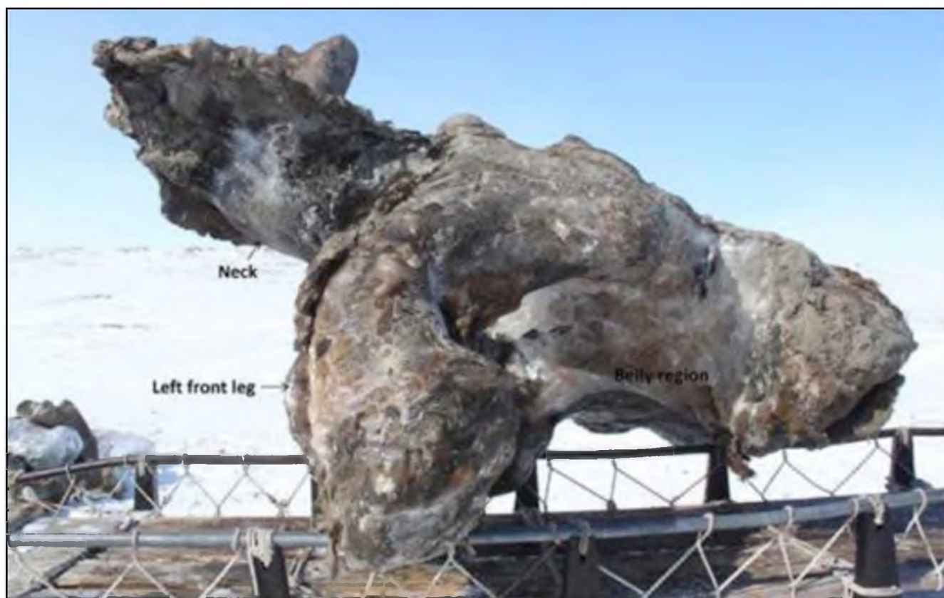
Fig. 1. Side view of mammoth carcass from Malyi Lyakhovski Island (New Siberian Islands).

The upper teeth (Fig. 2B) are deeply worn (anterior plates worn to the roots) and are smaller (length \approx 15 cm) than would be expected for M3s. Both are abnormally curved (concave toward the midline). Curvature of the left is more extreme, but the right is additionally affected by resorption along its lingual margin. In contrast, both lower teeth are m3s with normal configurations and lamellar frequencies of about 9.0 (Fig. 2C). The wear stage of the left m3 matches Laws' (1966) age group XXV (the right is slightly more advanced), suggesting an